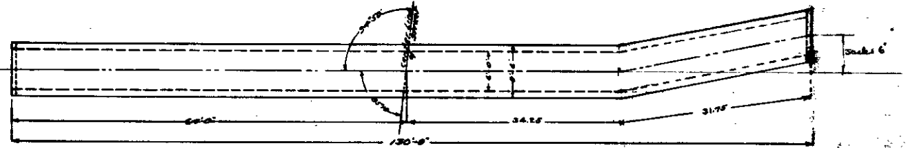
PLAN SCALE 1/4" = 10'